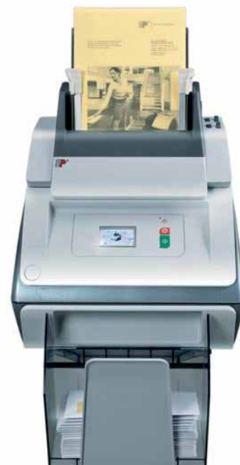
Table-top Inserting System FPi600