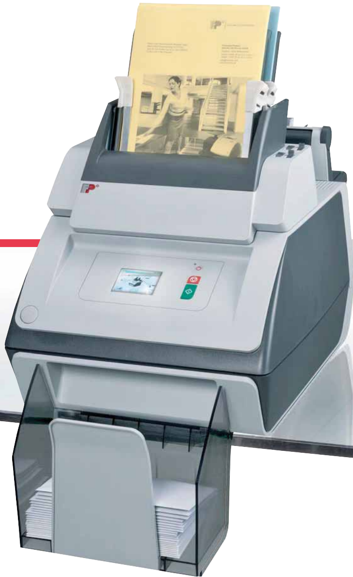
Table-top Inserting System FPI600