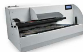
LP22 with reverse flow conveyor